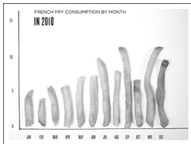
FIG. 1. One year of food consumption visualization by Lauren Manning.

A fourth project nicely incorporating various elements of quantified self-tracking, hardware hacking, quality-of-life improvements, and serendipity is Nancy Dougherty’s smile-triggered electromyogram (EMG) muscle sensor with an light emitting diode (LED) headband display. The project is